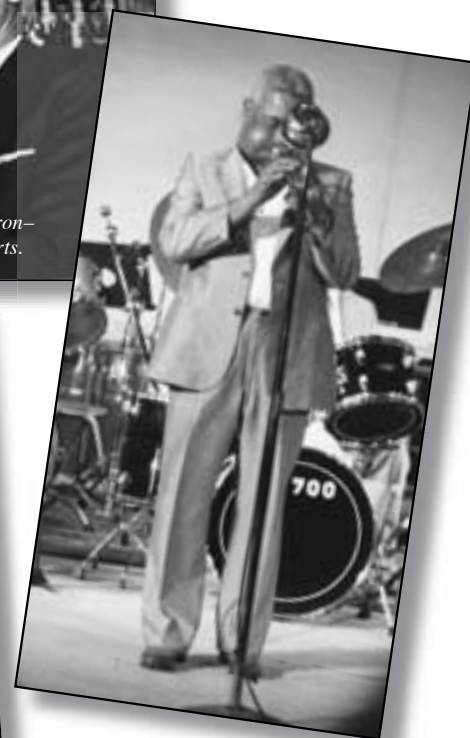
C. Everett Koop and Dizzy Gillispie, two of many notable citizens who have visited Bakersfield College over the years.