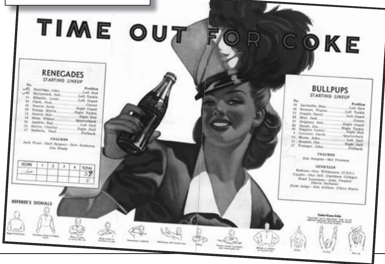
Football program - September 17, 1947